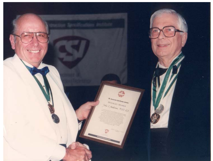
1988 Honorary Member