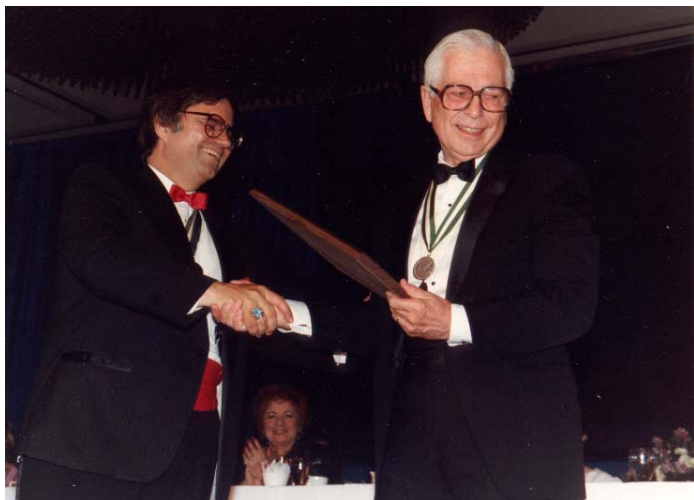
1987 President's Plaque